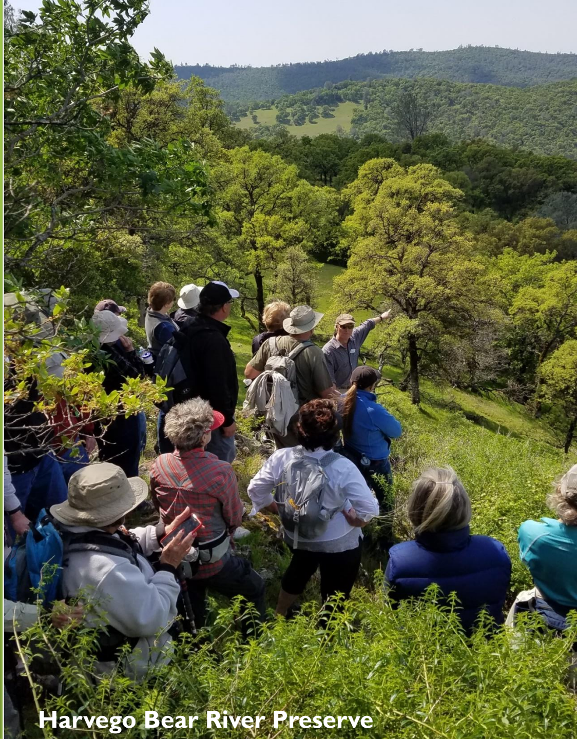
Harvego Bear River Preserve

We work with willing landowners and conservation partners to permanently protect natural and agricultural lands in Placer County for current and future generations.