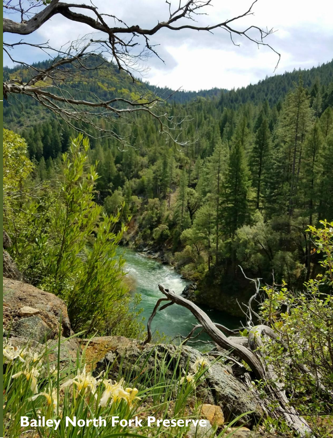
Bailey North Fork Preserve