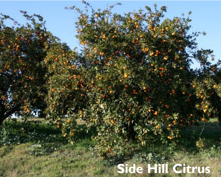
Side Hill Citrus