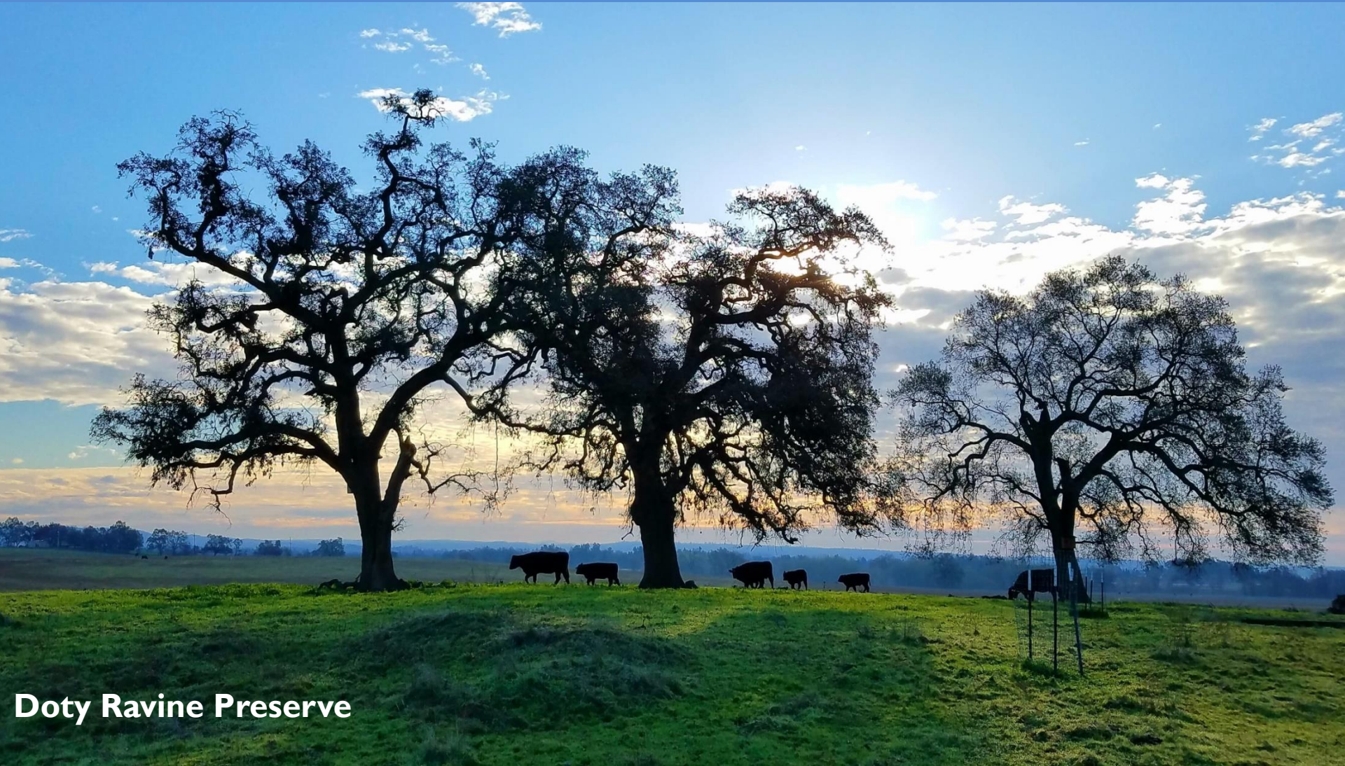
Doty Ravine Preserve